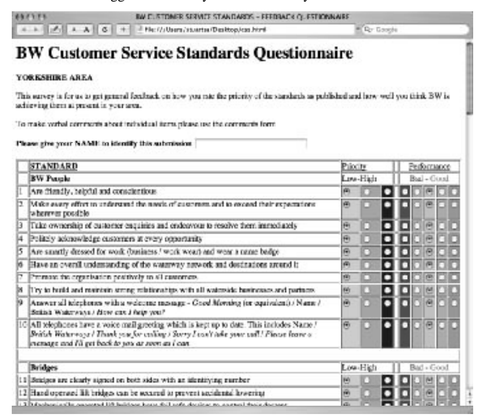
Preview of part of the questionnaire at the time of writing this article

There will be a separate form you can bring up on top of the main one for verbal comments and suggestions for any extra standards you think have been left out.