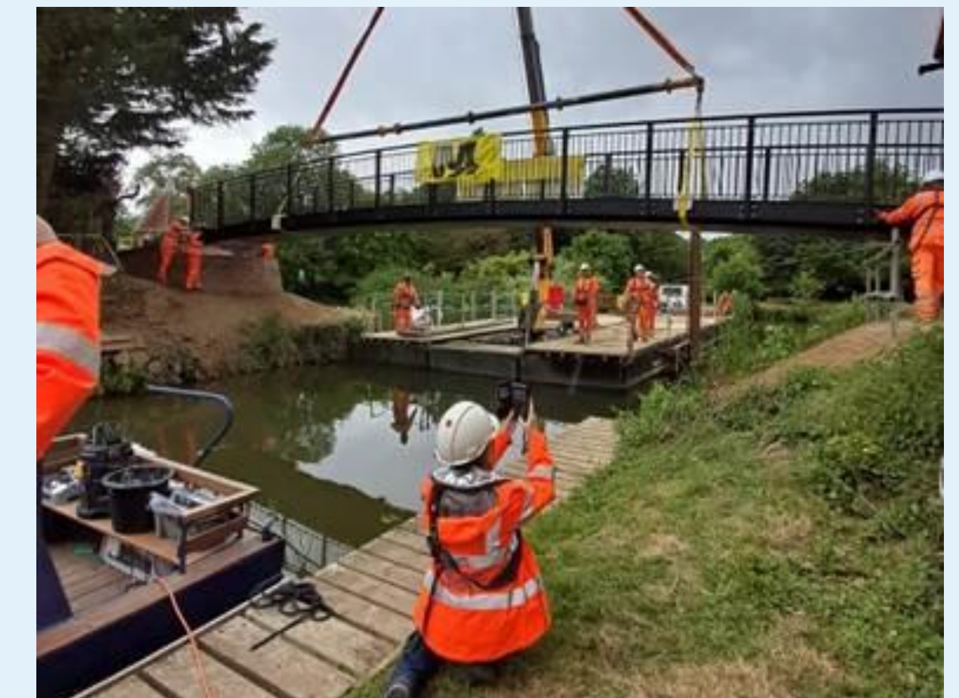
New bridge being lifted into position

The new footbridge forms part of the Medway Valley Walk and provides passage over the river entrance of Twyford Marina and significantly improves boat access to the marina.