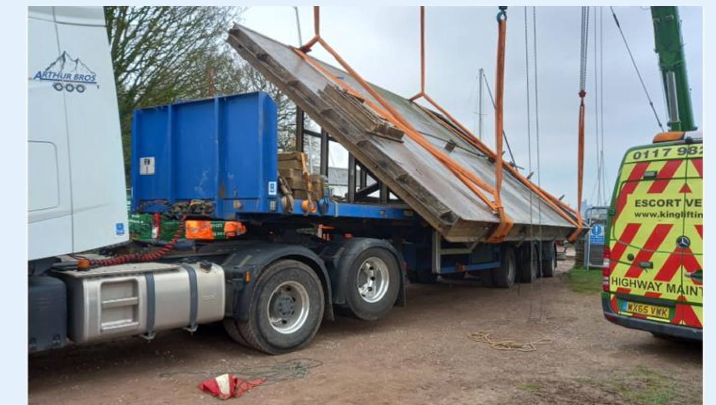
Sea gate being craned off the transporter

Our Navigation Team have also delivered significant inner harbour works with new mooring points installed and vegetation management. All works were completed in our role as landowner and Statutory Harbour Authority for Lydney.