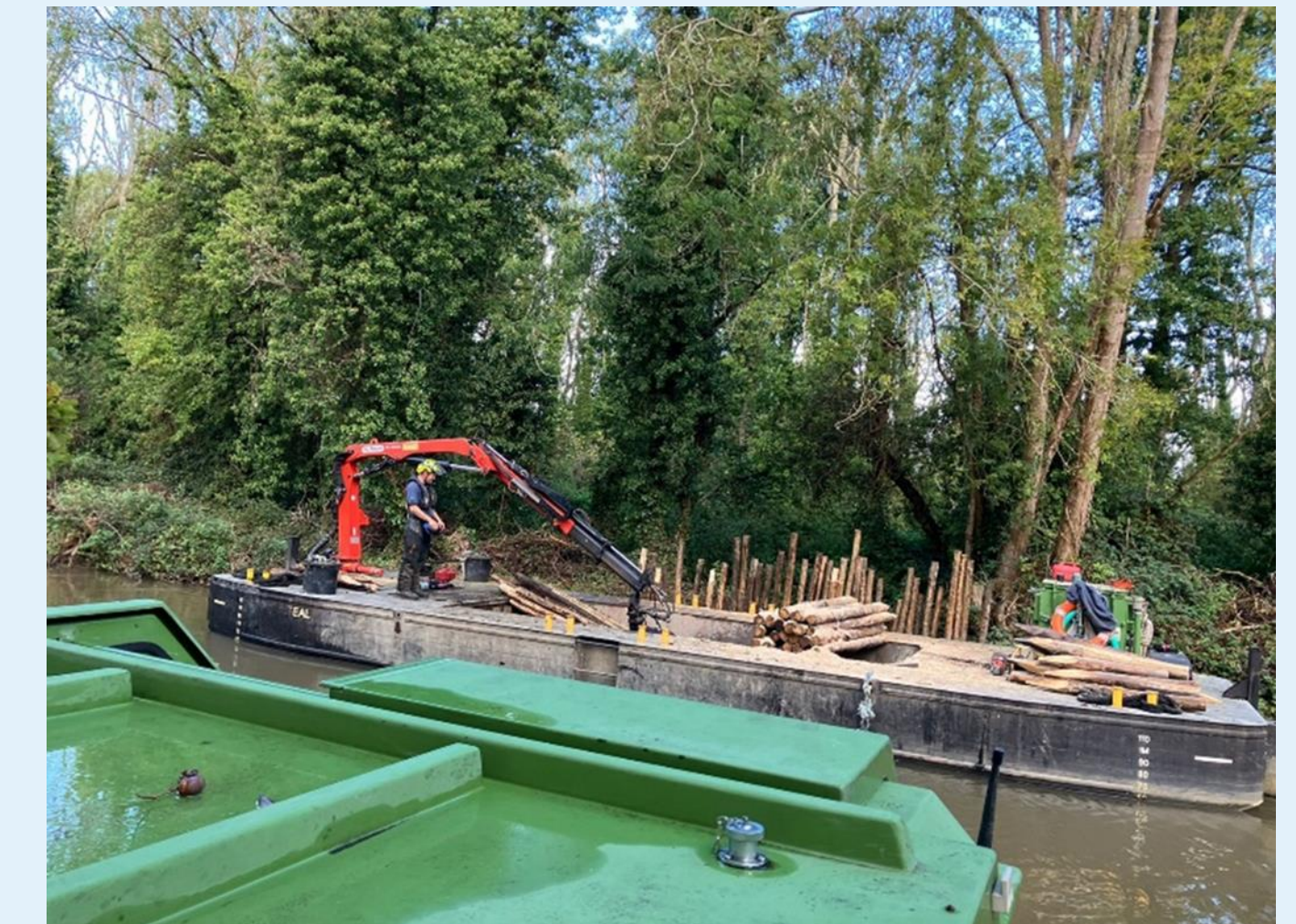
Bank stabilisation work from the river

The repair involved the use of locally sourced chestnut stakes to stabilise the bank at the breach site. Local willow rods were planted to further bind and stabilise the bank.