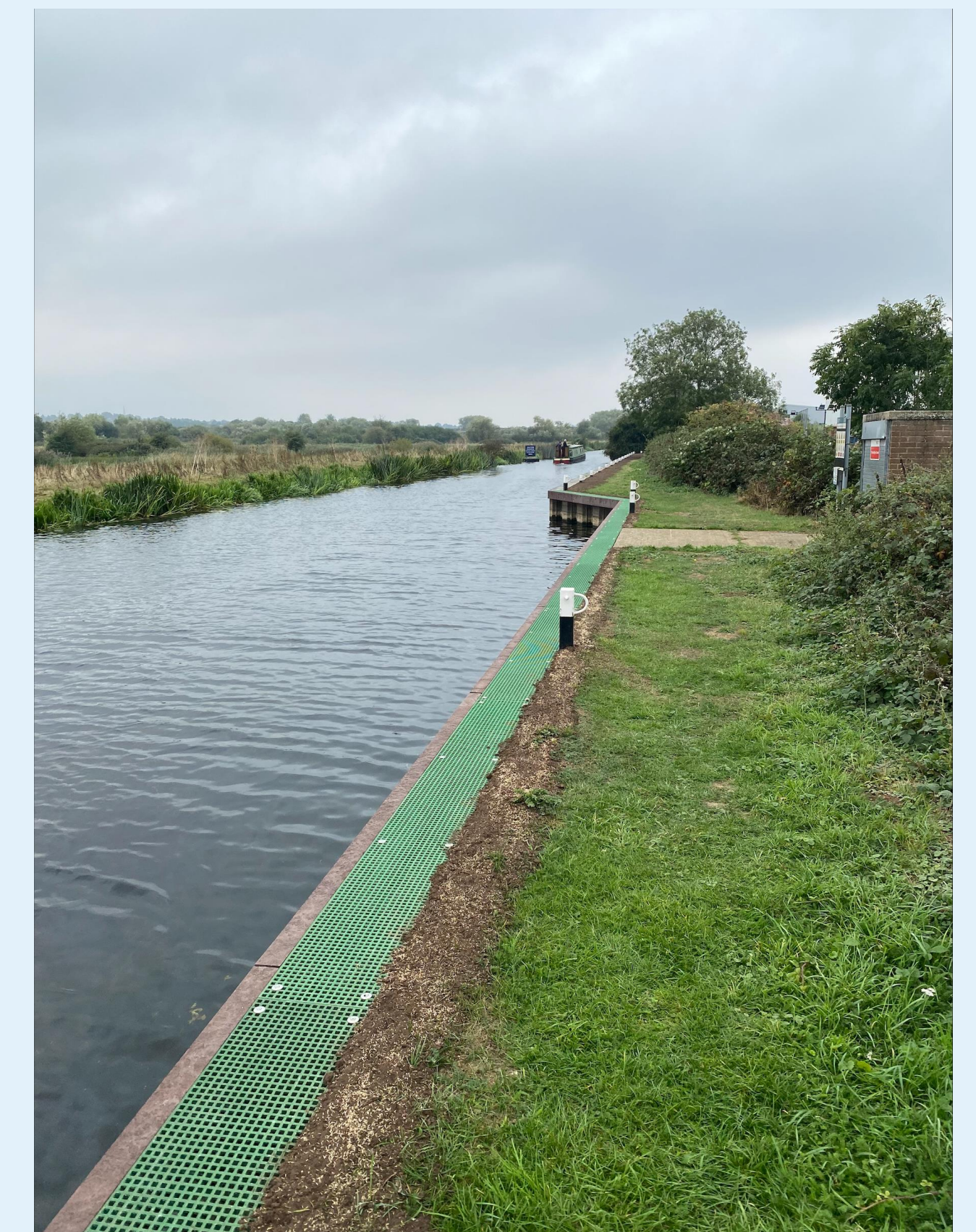
Mooring frontage at Irthlingborough

We are pleased to have completed refurbishment of 100m of mooring frontage at Irthlingborough on the river Nene, enhancing the experience for all users'.