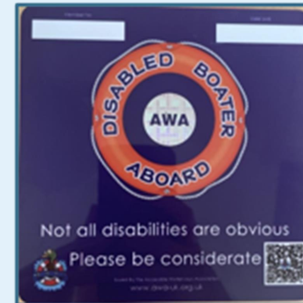
AWA 'blue badge'

Following our meeting we took a tour of the moorings and the site, as well as discussing areas that could benefit from improvements to enhance accessibility. We would like to thank AWA for their time. If anyone would like to arrange a meeting with us, please contact us on waterwaysanglian@environment-agency.gov.uk