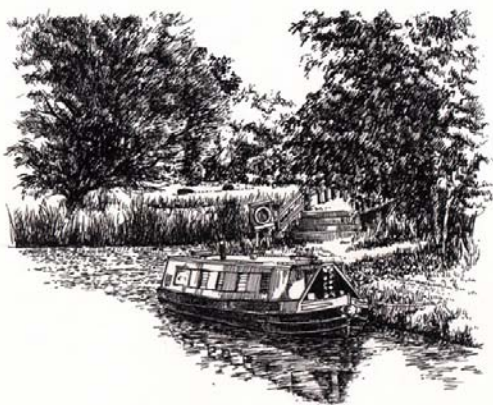
Mill Lane, Barrow-on-Soar

Returning to EA waters, the question as to whether these should be transferred to BW is still under discussion, and by the time you read this in October there may have already been an announcement. The very active Thames User Group (TUG) has been lobbying hard to stop this happening, because their current experience with EA is good. NABO has been supporting them. During the IWA Festival period I visited Marlow lock. It was neat and tidy and a credit, particularly to the