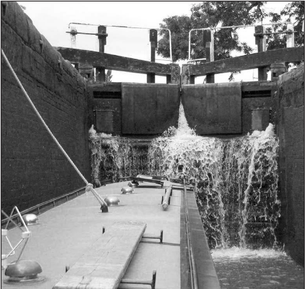
Top gate waterfall at Stenson Lock, Trent and Mersay Canal.

I suspect with the levels of maintenance we are going to have in the future, a sheet of plastic will again become an essential tool, particularly for the longer boats. The truth is that some years back it always was a necessity, and we have just lost that experience. We are going backwards at the moment.